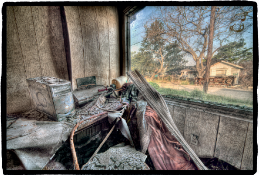
© Dan Burkholder. The Computer in the Window , New Orleans, from the series The Color of Loss , 2006. 20 x 30 inches. Inkjet print. Courtesy Catherine Couturier Gallery, Houston, TX.

Once my mother stopped by when I was retouching a platinum print on an old, tilted drafting table, and she said, “You look just like your grandfather,” who had been a draftsman. Now I’m sitting at that same table doing this platinum on vellum over gold leaf work. Yesterday I flipped down my high magnification magnifiers and using a tiny brush with eight hairs, painted in