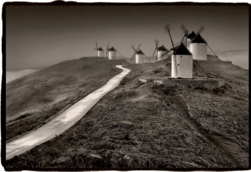
© Dan Burkholder. Windmills, Spain, 2002. 6 x 9 inches. Platinum/palladium print.

as they developed their vision. He also places that vision within the legacy of those who came before and the context of those who work today in stretching photography's bounds. A must for students and libraries, a great read (with excellent image reproduction) for anyone into the art and craft of photography. Here's an excerpt from the book, an interview with Dan Burkholder.—Editor