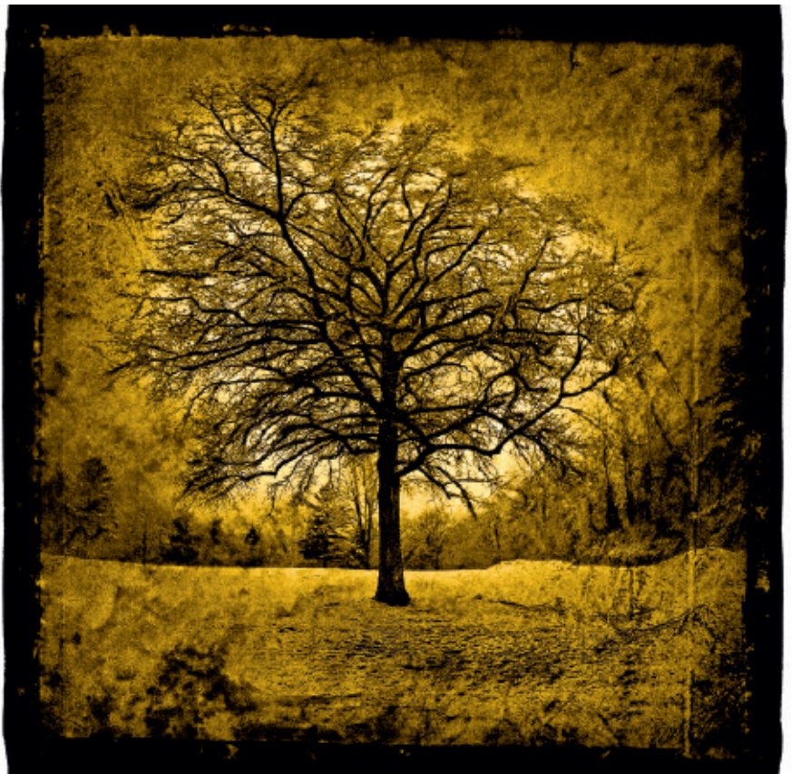
© Dan Burkholder. Tree in April Snow, Catskills, 2011. 10 x 10 inches. Platinum/palladium on vellum over gold leaf print. Courtesy of the Catherine Couturier Gallery, Houston, TX.

Among other characteristics it's my reluctance to rely entirely upon contemporary printing methods. In my latest platinum/palladium on vellum over gold leaf, I'm grinding palladium leaf with gold to create split tone effects. As beautiful as the archival inkjet print is, we certainly don't want a