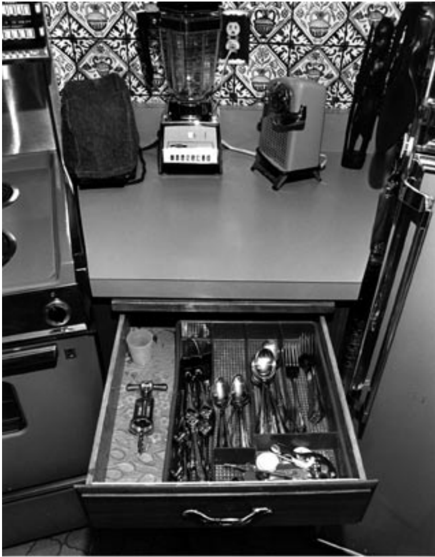
Untitled (silverware drawer 1970