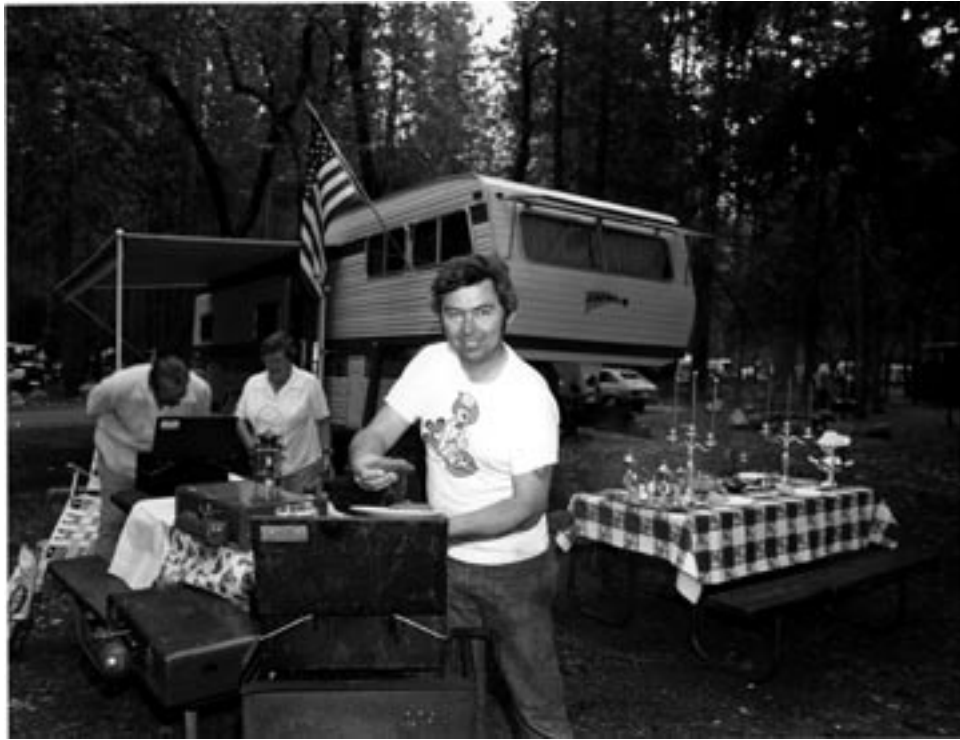
Every summer we go all out on our camp in Yosemite. I do the barbecuing. 1975