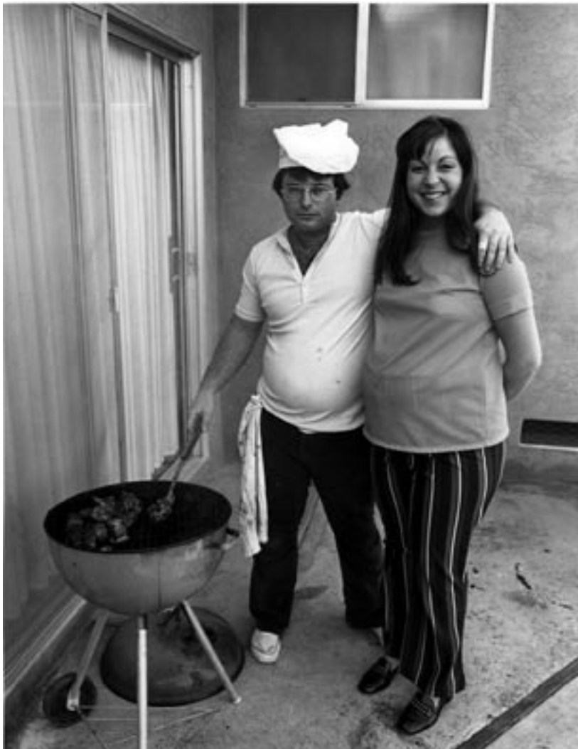
Sunday afternoon we get it together. I cook the steaks and my wife makes the salad. 1970