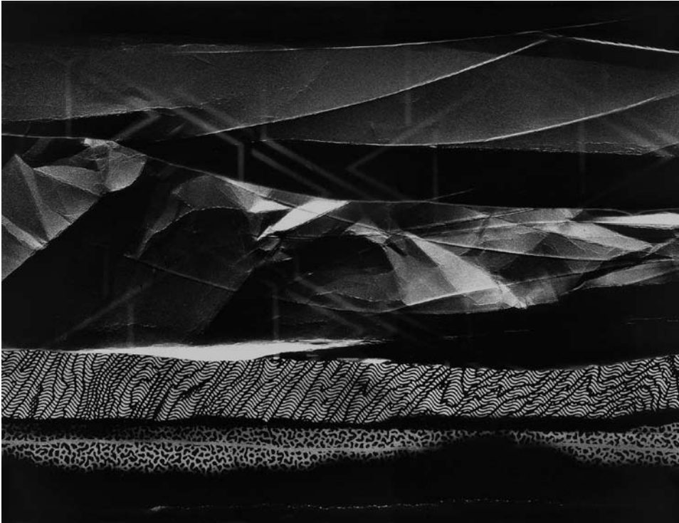
Tenaya 265, 1991

Sometimes people send me stuff. I just got a package of wonderful pieces of paper from a calligrapher who saw one of my presentations. A couple of my poker buddies bring me metal trash from their companies. Stuff comes from everywhere — the kitchen, pieces of metal from cans, foil off of wine bottles. I am always looking for new materials; it helps to break out of the ruts we all get into. Send me something!