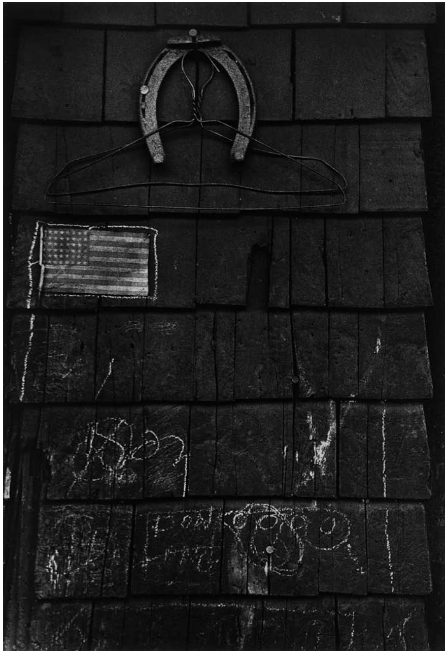
Carl Chiarenza: Interaction — Locomotive #6 , 1957