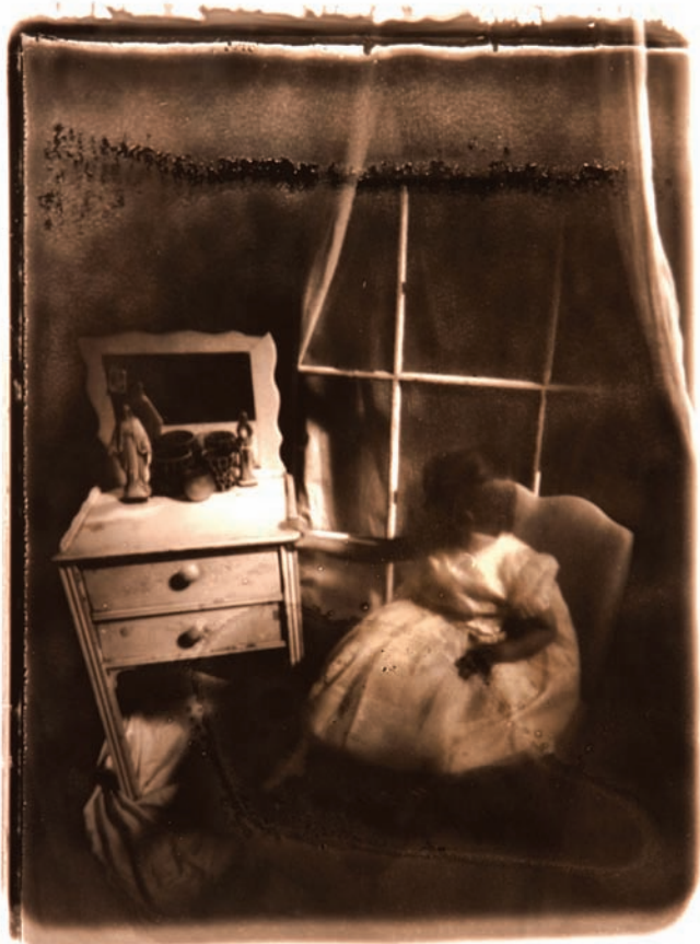
Tara , 11" x 14". Toned gelatin silver print and subject painted with Prickly Pear Black tea. Made with Dragonfly camera (not shown).