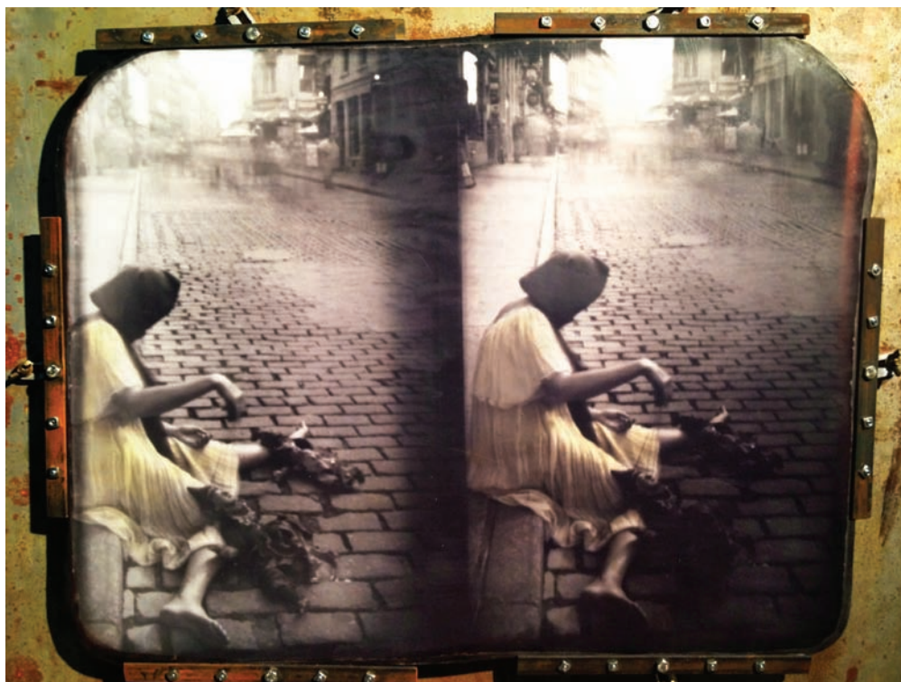
St. Margaret Bourgeoys , 2011, 30"x40". Gelatin silver print stained with Cactus tea. Made with the Yama camera.