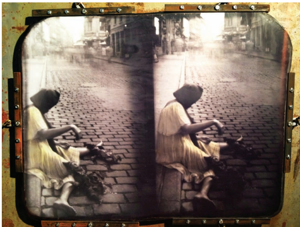
St. Margaret Bourgeoys , 2011, 30"x40". Gelatin silver print stained with Cactus tea. Made with the Yama camera.