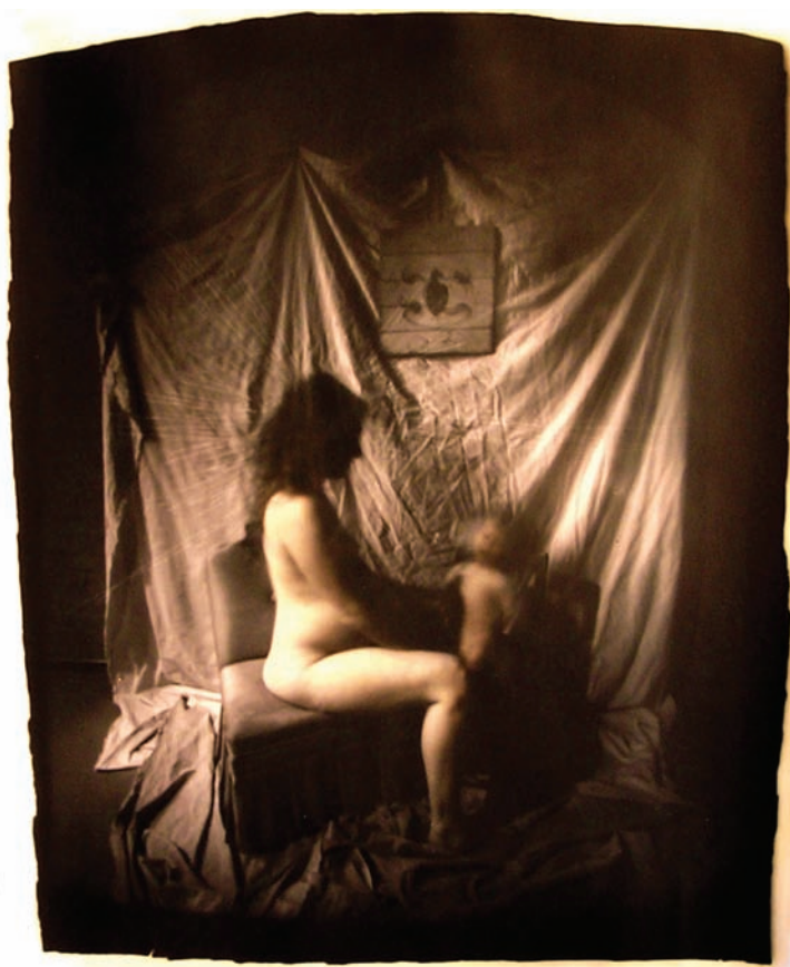
Three Graces , 2005, 11" x 14". Gelatin silver print. Made with Heart camera.